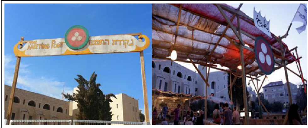
Figure 2. The ‘meeting point’ watermelon stand. On the right: with the sign in Arabic.